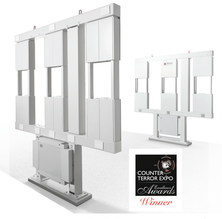
The FastTrack algorithm is winner of the Counter Terror Expo Excellence Award.